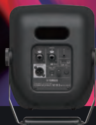
STAGEPAS 100BTR mkII shown