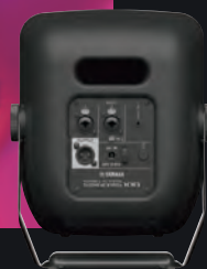
STAGEPAS 100 shown