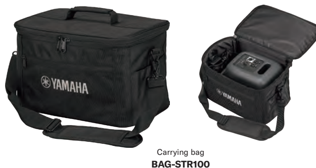
Carrying bag BAG-STR100