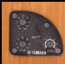
System 42 (CGX111SC)