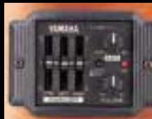
System 33 (CGX101)

The CGX111's electronics use EMF's highly responsive and ultra thin B-Band™ Pickup mounted under the saddle. This system's no frills approach supplies everything essential to tailor your sound with high and low tone controls and volume.