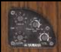
System 43 (CGX171CC)

The CGX171's electronics use EMF's highly responsive and ultra thin B-Band™ Pickup mounted under the saddle along with a condenser microphone for absolute acoustic sound reproduction. Controls include high and low tone controls, master volume and a unique mic mix control that allows both mic level and phase adjustment to eliminate feedback in live situations.