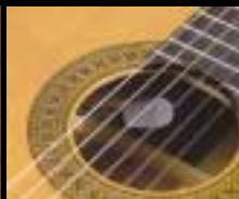
Microphone with Goose Neck