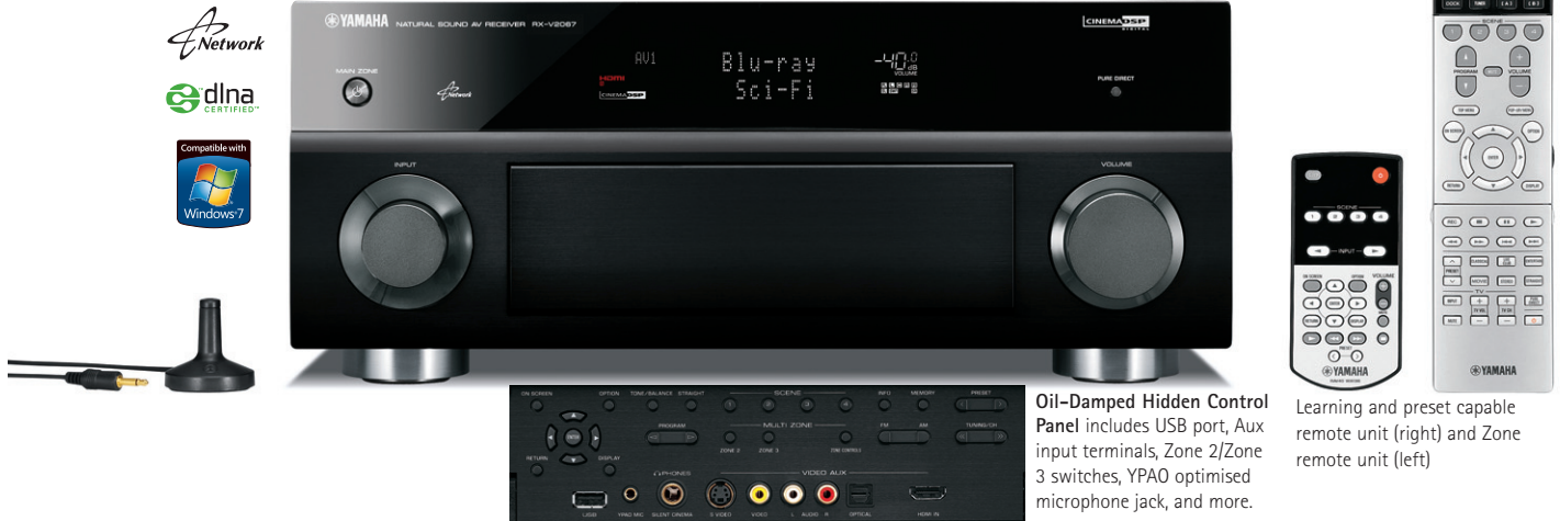
Oil-Damped Hidden Control Panel includes USB port, Aux input terminals, Zone 2/Zone 3 switches, YPAO optimised microphone jack, and more.

9.2-channel operation capability, 8 in/2 out HDMI (V.1.4a with 3D and Audio Return Channel), HD Audio decoding with CINEMA DSP, HQV video quality, new GUI, new YPAO with Reflected Sound Control and new SCENE functionality.