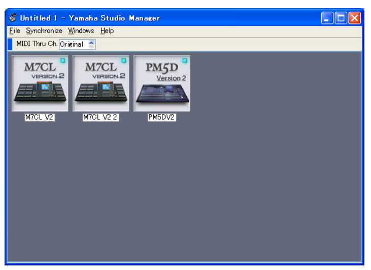
Studio Manager window

In the Studio Manager window, double-click the icon for each editor.